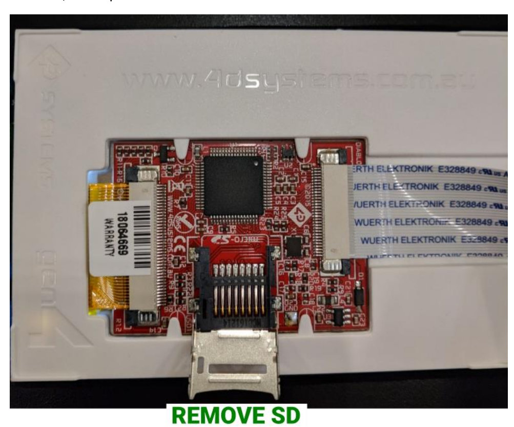
Step 7: Follow all previous steps in reverse to re-latch the SD card and reassemble the top touchscreen enclosure. Power may be turned back on after it has been assembled.